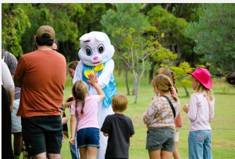
Photos: Bouldercombe youngsters enjoying Easter Fun Day.

We value every opportunity to support events that bring people together, celebrate local history, and strengthen community wellbeing. It's a privilege to play even a small part in the activities that matter most to the communities we work alongside.