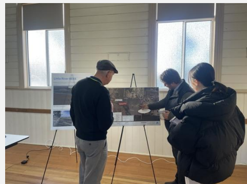
Photos: Community drop-in sessions at the beautiful Little River Mechanics’ Institute and Library in mid-2025.

We’ll continue working closely with the Little River community as the project moves forward into early works and then full construction. More updates to come as we get ready to break ground.